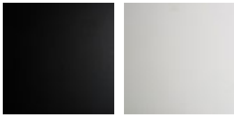
OP17 matt schwarz OP71 matt weiß