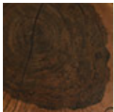
Mdf furniert mit nussbaumschnitt