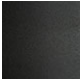
GFM69 graphit gaufriert