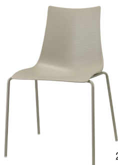
2695 VT 15

Scocca in tecnopolimero riciclabile. Struttura a 4 gambe in tubo d'acciaio ø mm 16 verniciato con polvere poliestere. Per uso interno ed esterno. Impilabile.