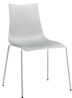
2695 VL 11