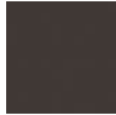
LM21 London grau Fenix