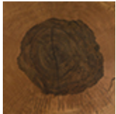
schnitt von Eiche baumstamm