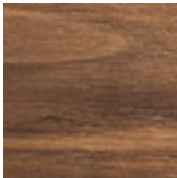
NC nussbaum canaletto